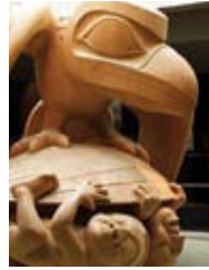
BILL REID ROTUNDA