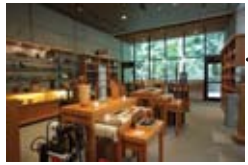
LOBBY + SHOP