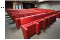
MICHAEL M. AMES THEATRE