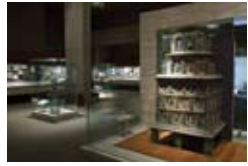
KOERNER EUROPEAN CERAMICS GALLERY